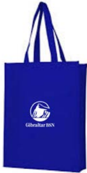
Non Woven Bag