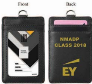
PU Card Holder